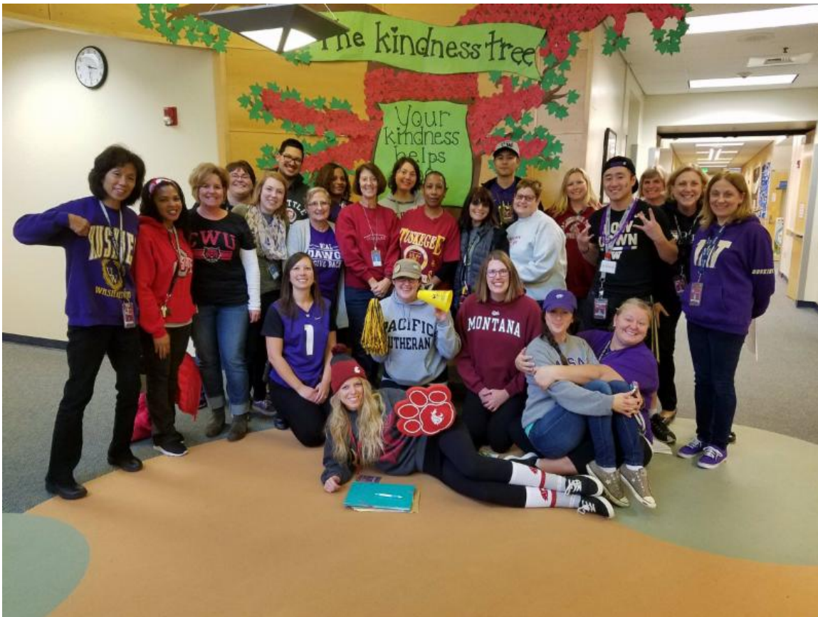
Educators at Benson Hill Elementary School (Renton) show off their college gear during DiscoverU Week 2017.

Are you an elementary school teacher who loves DiscoverU and plans activities every year for your students? If so, join us Tuesday, June 26 and Wednesday, June 27 for a paid opportunity to help create in-class activities we can share with other teachers in the region.