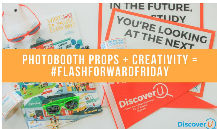
Photo Booth Fun